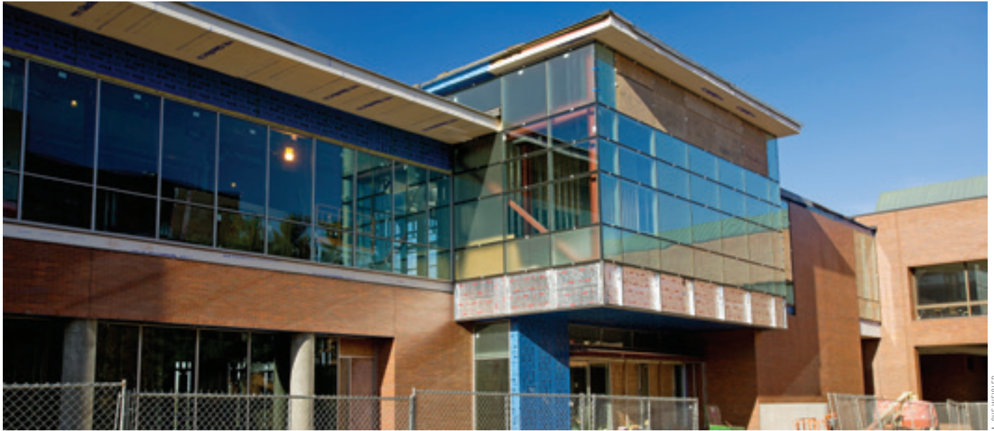
Creating an Innovative Space Construction continues on Sebastian and Lenore Rosica Hall, slated to open in October.

Construction of Sebastian and Lenore Rosica Hall, which began in June 2012, is proceeding ahead of schedule. The building now is fully enclosed and is connected to all utilities and heat. Work through the winter months will shift to the building interior. A live web cam allows viewing of the construction, and can be found at www.ntid.rit.edu/rosica-hall/livecam .